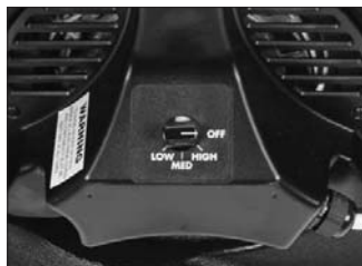
3 position switch

Do not stack dryers more than two units high without tie-downs